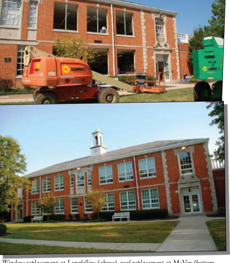
Window replacement at Longfellow (above), roof replacement at McVay (bottom left), and fieldhouse renovations and addition at Westerville South's stadium (bottom right) are just a few projects that were on tap before classes began.